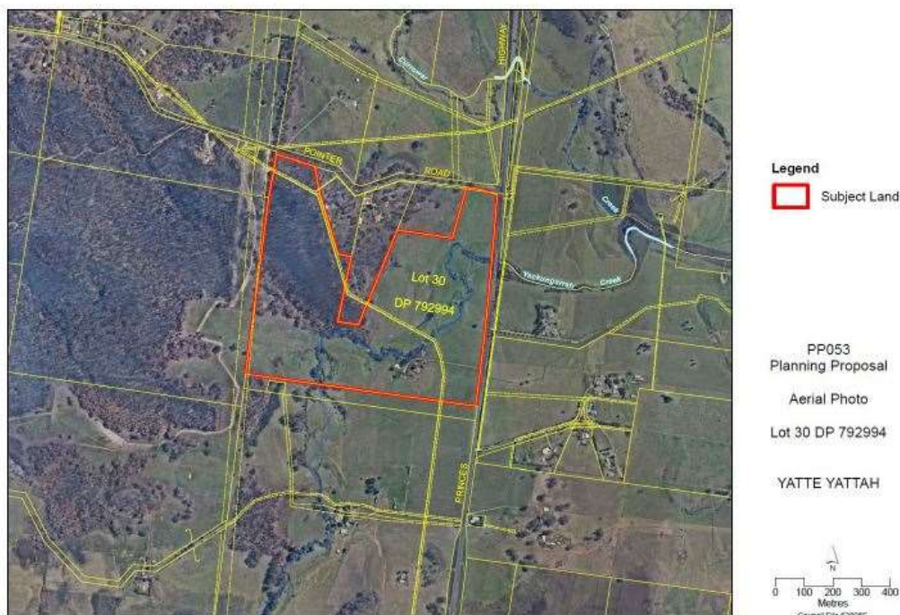
Figure 2: Subject site prior to Currowan Bushfire (Source: Shoalhaven City Council)

Figure 1: Subject site and locality plan (Source: Shoalhaven City Council)